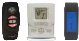
See our Ambient Technologies® catalog for a complete line of remotes and thermostats.